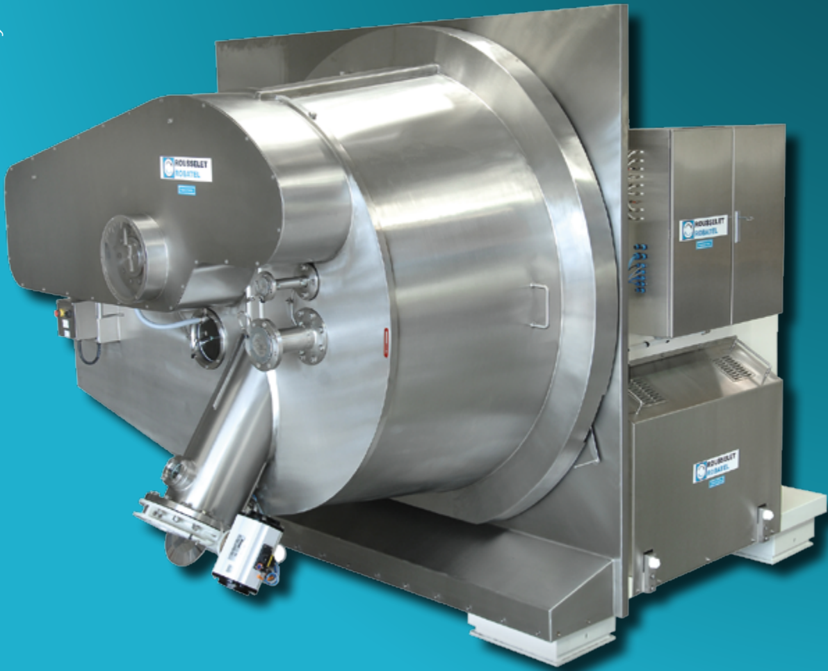
EHL 16663 DRG