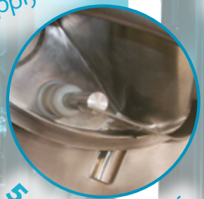
5. Cake detector