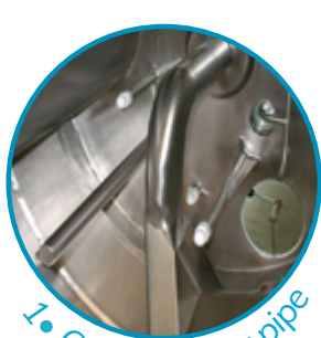
1. Cake washing pipe