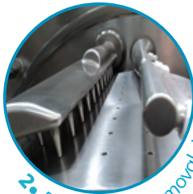
2. Residual heel removal device