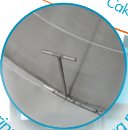
3. Filtering media applying principle