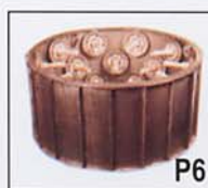
Basket for conical bobbins / packages. Type KBO.