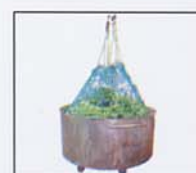
Loading trolley (for Type KFI).