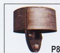
Basket with bottom opening for use in laundry industry. Type KFO and KLU.