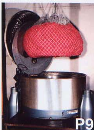
Hydro-extractor with removable net for hanks, pieces and fabrics. Type KFI.

PRODUCTIVITY : With different basket/carriers, loading and unloading operations can be carried out more effectively, consequently reducing dead time resulting in improved production efficiency.