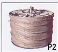
Basket for loose stock fibres to be used in conjunction with a autoclave (kier).