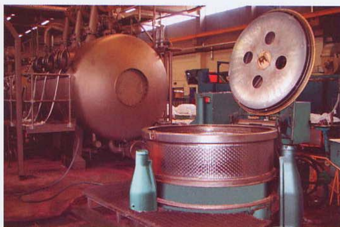
Hydro-extractor with automatic "Lid/basket rim" assy motion

APPLICATIONS De-watering of all types of textile products (cable, fibre cakes, loose stock, fabrics, tubular knitted fabrics, hanks, tops, conical/cylindrical bobbins, packages, flock and hosiery) following wet processing which includes washing, dyeing, bleaching, carbonising and softening.