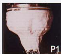
Removable filtration bag for flocks. Type KSA.