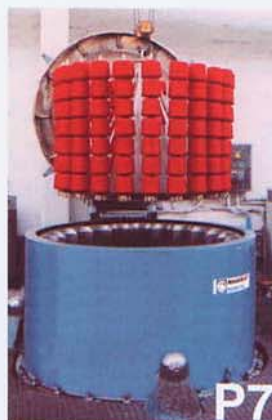
Hydro-extractors with spindle holder for conical / cylindrical bobbins. Type KBOB