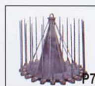
Spindle holder being loaded into specially formed basket for conical / cylindrical bobbins. Type KBOB.