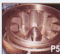
Cell basket for tops, cylindrical bobbins. Type KFUS.